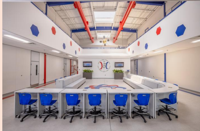
Howard B. Owens Science Center Building 2025 – Less than $50M Johnson, Mirmiran & Thompson (JMT)

Share the moment—bring your client to celebrate with you!