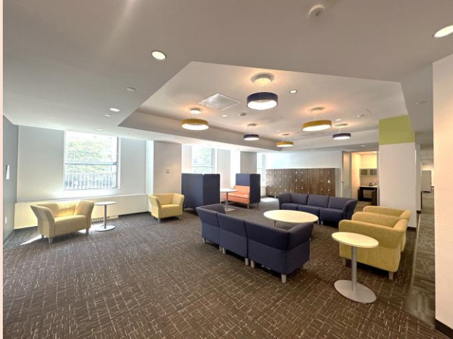
Department of Veteran Affairs HQ Building Award 2025 – Less than $50M Procon Consulting