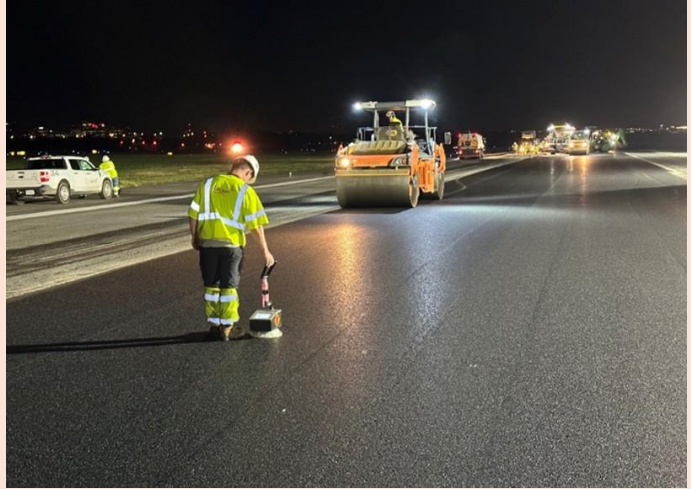
DCA Airport Runways Rehabilitation Infrastructure Award 2025 – Greater than $50M Keville Enterprises